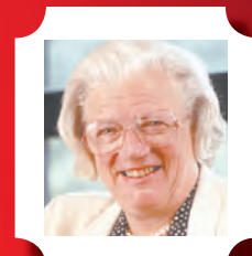
HANNA HOLBORN GRAY