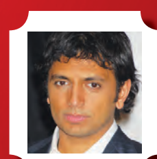
M. NIGHT SHYAMALAN