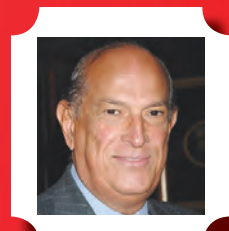
OSCAR DE LA RENTA