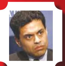
FAREED ZAKARIA FOREIGN POLICY ANALYST