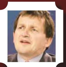
CHARLES SIMONYI BUSINESS LEADER