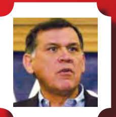
MELQUIADES MARTINEZ U.S. SENATOR