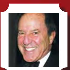
MORT ZUCKERMAN BUSINESS LEADER