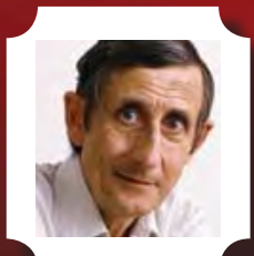
FREEMAN DYSON PHYSICIST, MATHEMATICIAN