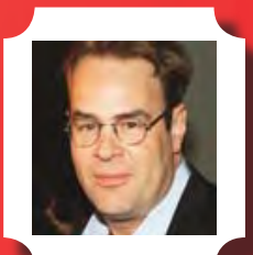
DAN AYKROYD ACTOR