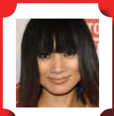
BAI LING ACTRESS