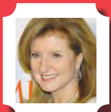
ARIANNA HUFFINGTON JOURNALIST