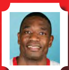
DIKEMBE MUTOMBO ATHLETE