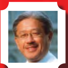
VICTOR DZAU SCIENTIST