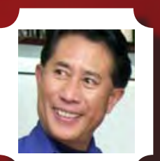
MARTIN YAN CHEF