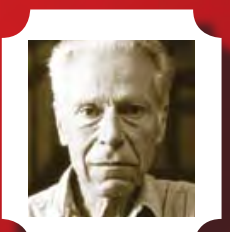
ALBERT HIRSCHMAN ECONOMIST