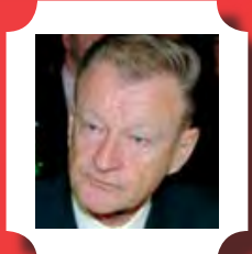
ZBIGNIEW BRZEZINSKI FORMER NATIONAL SECURITY ADVISOR