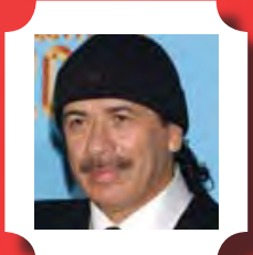
CARLOS SANTANA MUSICIAN