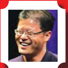
JERRY YANG BUSINESS LEADER