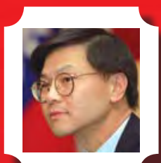
DAVID HO SCIENTIST