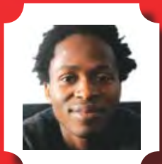
ISHMAEL BEAH WRITER