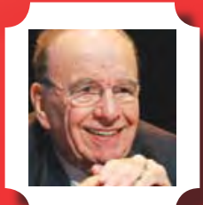
RUPERT MURDOCH BUSINESS LEADER