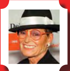
LIZ CLAIBORNE DESIGNER