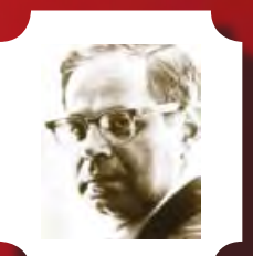
MAX FRANKEL JOURNALIST

The United States of America remains a land of immigrants. Andrew Carnegie, who founded Carnegie Corporation of New York in 1911, was an immigrant from Scotland. We at Carnegie Corporation salute his legacy, along with the contributions of the millions of other immigrants who have made, and continue to make, our nation strong and vibrant. We are committed to helping immigrants become integrated into the civic fabric of our nation because enlightened citizenship is the everlasting strength of our democracy. Our national motto, E pluribus unum — “out of many, one” — continues to be an ideal we can all aspire to and a true guiding light for our nation.