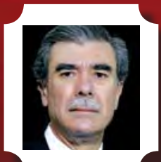
CARLOS GUTIERREZ U.S. SECRETARY OF COMMERCE