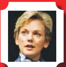
JENNIFER GRANHOLM U.S. GOVERNOR