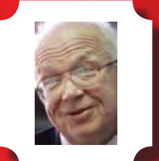
SERGEI KHRUSHCHEV ACADEMIC