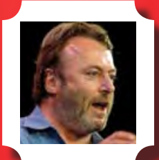
CHRISTOPHER HITCHENS JOURNALIST, WRITER