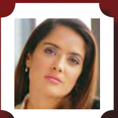
SALMA HAYEK ACTRESS