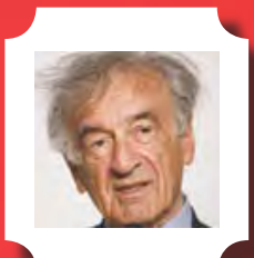
ELIE WIESEL HUMANITARIAN, NOBEL PRIZE WINNER