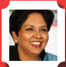
INDRA NOOYI BUSINESS LEADER