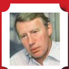
ROBERT MACNEIL JOURNALIST