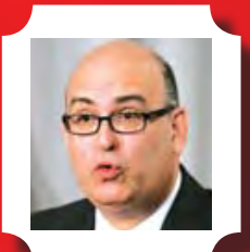
EMILIO GONZALEZ DIRECTOR, U.S. DEPARTMENT OF HOMELAND SECURITY