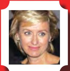
TINA BROWN JOURNALIST