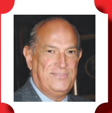
OSCAR DE LA RENTA