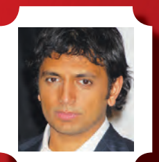
M. NIGHT SHYAMALAN