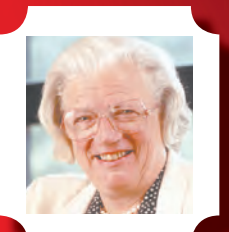
HANNA HOLBORN GRAY