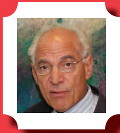
FAROUK EL-BAZ GEOLOGIST