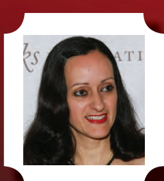
ISABEL TOLEDO FASHION DESIGNER