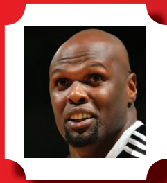
ADONAL FOYLE BASKETBALL PLAYER & ACTIVIST