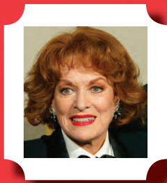
MAUREEN O'HARA BLAIR ACTRESS