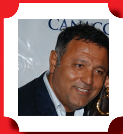
ELIE TAHARI FASHION DESIGNER