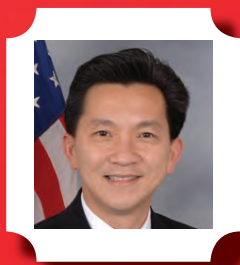
ANH "JOSEPH" CAO US HOUSE OF REPRESENTATIVES