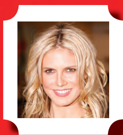
HEIDI KLUM SUPERMODEL