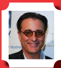
ANDY GARCIA ACTOR