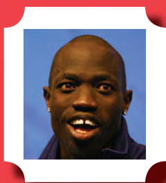
LOPEZ LOMONG OLYMPIAN