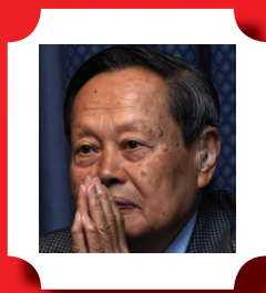
CHEN NING YAN NOBEL LAUREATE IN PHYSICS