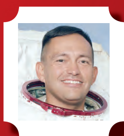
CARLOS I. NORIEGA FORMER ASTRONAUT