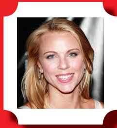
LARA LOGAN CBS JOURNALIST