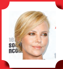
CHARLIZE THERON OSCAR WINNING ACTRESS