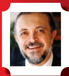
MARIO MOLINA NOBEL LAUREATE IN CHEMISTRY