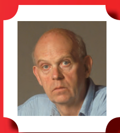
CLAES OLDENBURG SCULPTOR