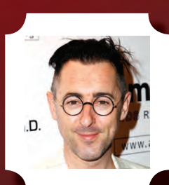
ALAN CUMMING ACTOR