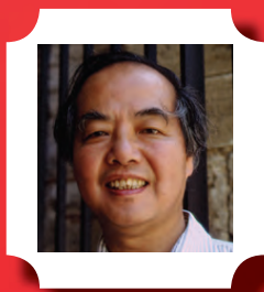
TSUNG-DAO LEE NOBEL LAUREATE IN PHYSICS