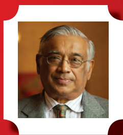
S. R. SRINIVASA VARADHAN FIELDS MEDALIST