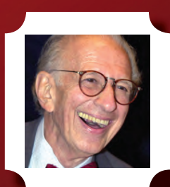
ERIC R. KANDEL NOBEL LAUREATE IN MEDICINE