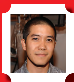
THAKOON PANICHGUL FASHION DESIGNER