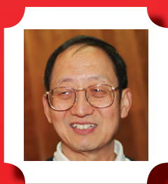
DANIEL C. TSUI NOBEL LAUREATE IN PHYSICS