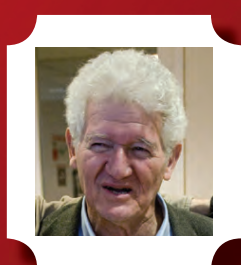
PETER D. LAX ABEL PRIZE WINNER