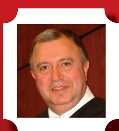
SAMUEL DER-YEGHAYAN UNITED STATES FEDERAL JUDGE NORTHERN DISTRICT OF ILLINOIS