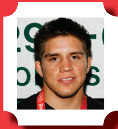
HENRY CEJUDO OLYMPIAN