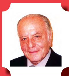
JOSEPH TUSIANI POET