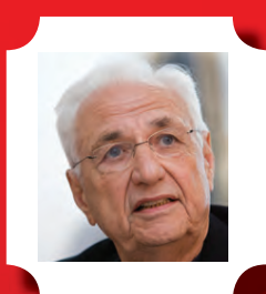
FRANK GEHRY ARCHITECT