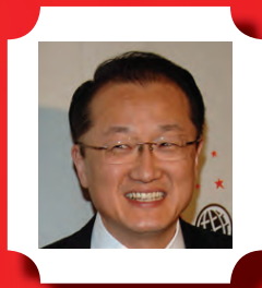
JIM YONG KIM PRESIDENT OF DARTMOUTH