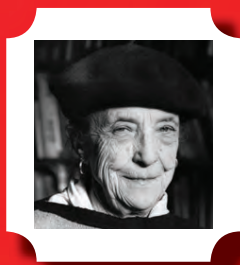
LOUISE BOURGEOIS SCULPTOR