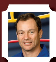
MICHAEL E. LOPEZ-ALEGRIA ASTRONAUT