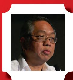
SHING TUNG YAU FIELDS MEDALIST