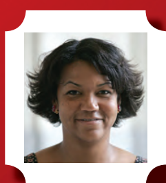
HELENE COOPER WHITE HOUSE CORRESPONDENT, THE NEW YORK TIMES