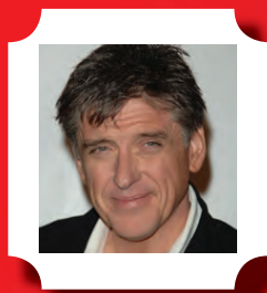
CRAIG FERGUSON COMEDIAN