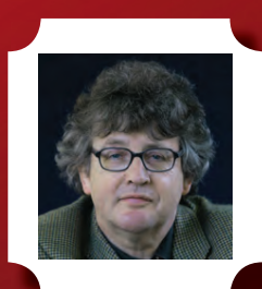
PAUL MULDOON POET