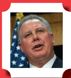
ALBIO SIRES US HOUSE OF REPRESENTATIVES