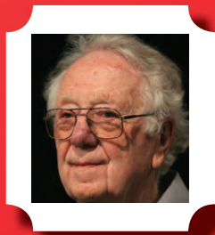
OLIVER SMITHIES NOBEL LAUREATE IN MEDICINE