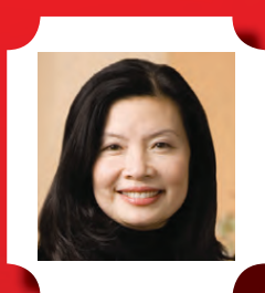
JENNY MING FORMER CEO OF OLD NAVY