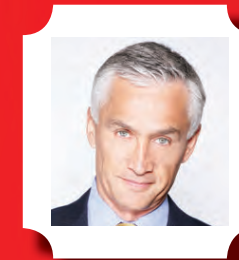
JORGE RAMOS TV NEWS ANCHOR