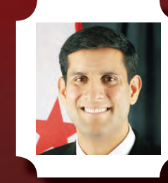
VIVEK KUNDR 1ST CHIEF INFORMATION OFFICER OF THE UNITED STATES