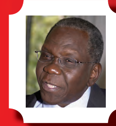
DUMARSAIS SIMEUS FORMER CEO OF BEATRICE FOOD