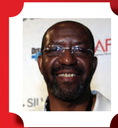
KOYO NNAMDI NPR HOST