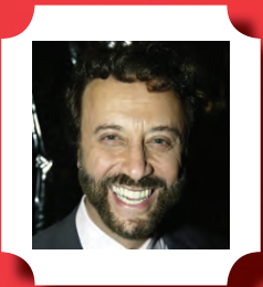
YAKOV SMIRNOFF COMEDIAN