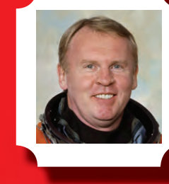
ANDREW S. W. THOMAS NASA ASTRONAUT

The United States of America remains a land of immigrants. Andrew Carnegie, who founded Carnegie Corporation of New York in 1911, was an immigrant from Scotland. We at Carnegie Corporation salute his legacy, along with the contributions of the millions of other immigrants who have made, and continue to make, our nation strong and vibrant. We are committed to helping immigrants become integrated into the civic fabric of our nation because enlightened citizenship is the everlasting strength of our democracy. Our national motto, E pluribus unum — “out of many, one” — continues to be an ideal we can all aspire to and a true guiding light for our nation.