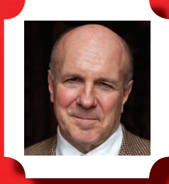
SIMON WINCHESTER AUTHOR