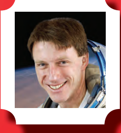
C. MICHAEL FOALE NASA ASTRONAUT