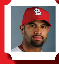
ALBERT PUJOLS BASEBALL PLAYER