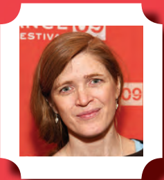
SAMANTHA POWER SPECIAL ASSISTANT TO PRESIDENT OBAMA