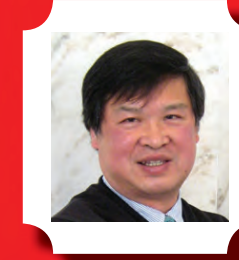
DENNY CHIN JUDGE OF UNITED STATES COURT OF APPEALS FOR THE SECOND CIRCUIT