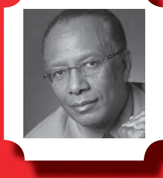
ORLANDO PATTERSON HARVARD UNIVERSITY SCHOLAR