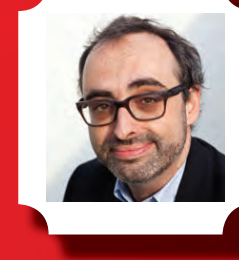
GARY SHTEYNGART AUTHOR