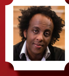
DINAW MENGESTU VILCEK PRIZE FOR CREATIVE PROMISE IN LITERATURE