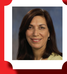
HUDA ZOGHBI WINNER VILCEK PRIZE FOR BIOMEDICAL SCIENCE