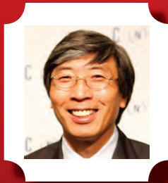
PATRICK SOON-SHIONG CEO OF ABRAXIS BIOSCIENCE