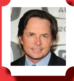
MICHAEL J. FOX ACTOR PHILANTHROPIST