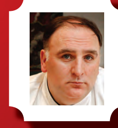
JOSÉ ANDRÉS CELEBRITY CHEF